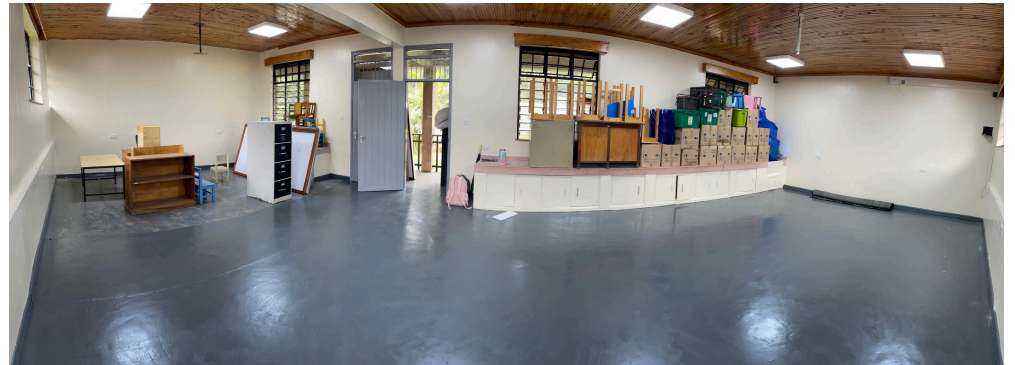
Above is the room ready to start setting up.