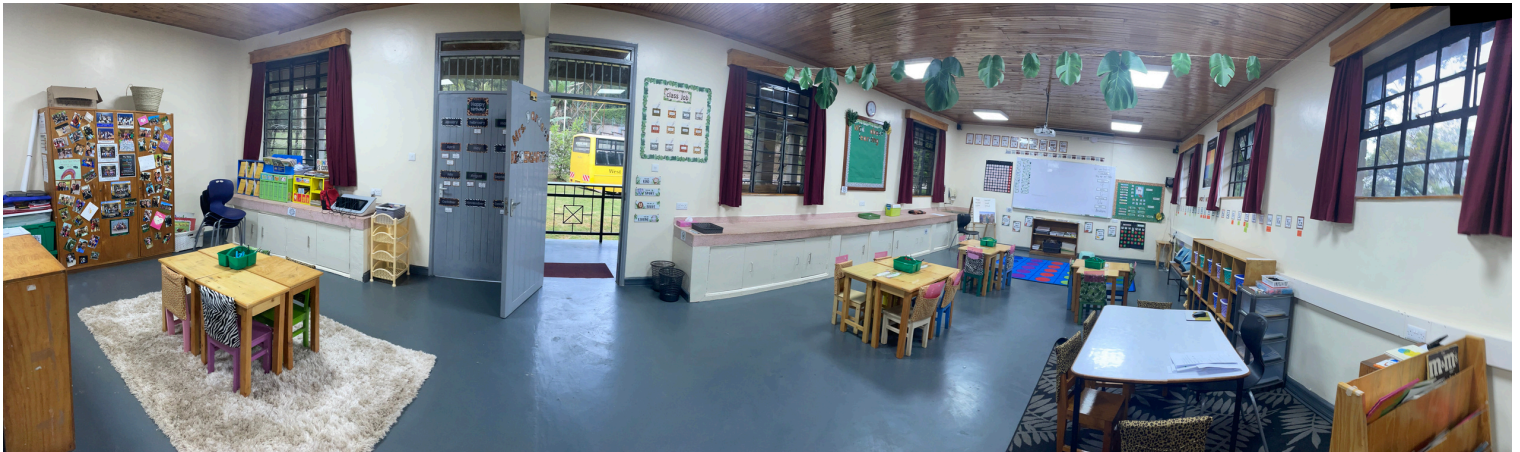
Below is the finished classroom!

Every Wednesday we pray as a staff for a grade level. I am the only kindergarten class at the school so I got to host everyone in my classroom recently. It was such a blessing! I was able to host my students' prayer requests on the screen and hear the teachers in small groups praying. This transition to Christian education from public education has been so sweet.