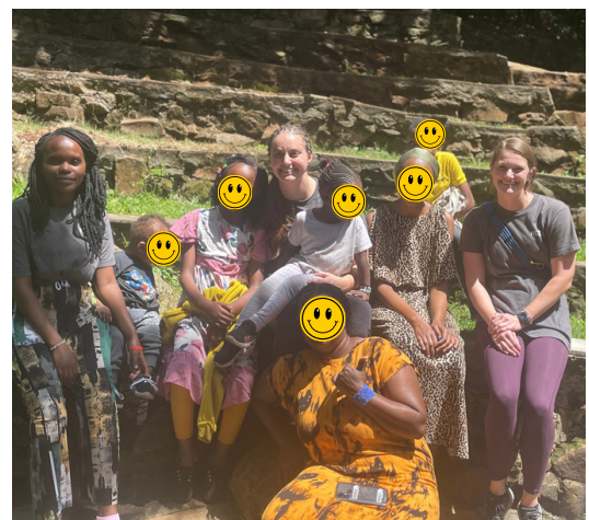
We went to the park.