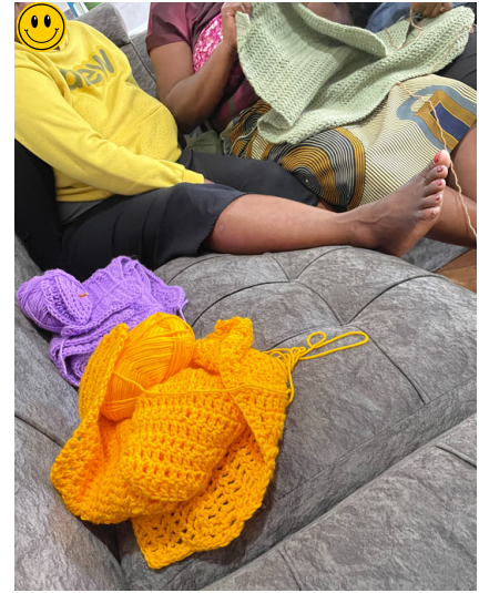
We made pasta necklaces. I taught the women how to crochet.