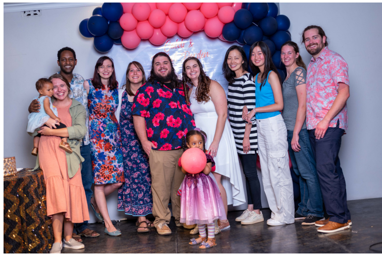
West Nairobi School