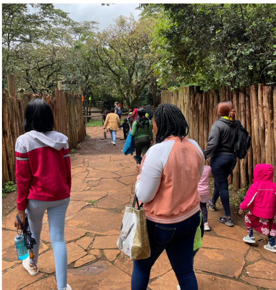
We took a trip to the safari walk which is like a zoo.