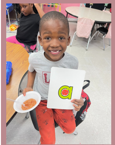
We made applesauce for the letter A.

It has been a whirlwind of emotions as I wrap up this school year. One of the happy moments of each day has been counting down the school year with a letter a day. We started with the letter A at the end of April and are working our way to the letter Z in June. Check out just a few of the fun memories we have been making as a class!