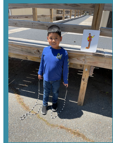
We had fun with jump ropes for the letter J.