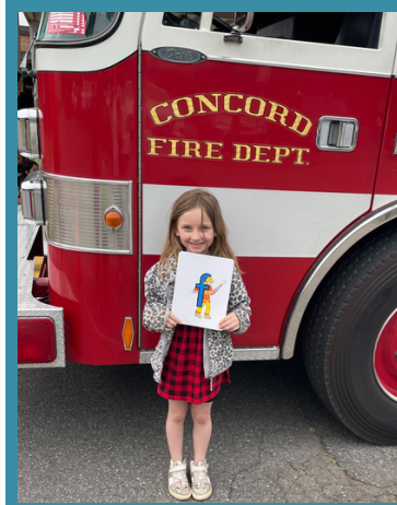
We had a firetruck come for the letter F.