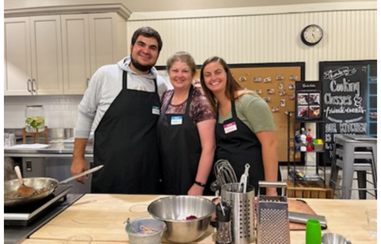
My brother and I enjoyed a cooking class with mom for her Mother's Day gift!