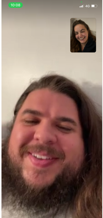
My perspective 10:30 pm

I would like to give you a little glimpse into my personal life. I have prayed for an opportunity to live in Kenya on missions for 10 years. I have also prayed for 10 years for a godly man to date, marry, and to serve God with. Well... God has a funny sense of humor, because he answered both requests at the same time. This was not the situation I had in mind when I was praying for these two things. But, God is teaching me that His plan is better than any plan I could create myself.